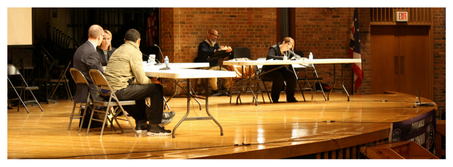
We will need three microphones. One at each table.